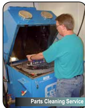
Parts Cleaning Service

Contact Matric at 800.462.8742 to speak with a customer service representative about aftermarket services.