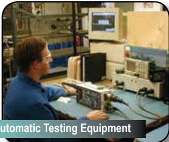
Automatic Testing Equipment