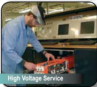
High Voltage Service

Matric has the edge in aftermarket services with unequalled experience, expertise and technology. The commitment to customer satisfaction continues long after products are delivered. Product upgrades, calibration and repair services are available to maintain the proper operation of your electronics.