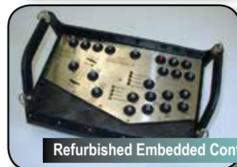
Refurbished Embedded Controls